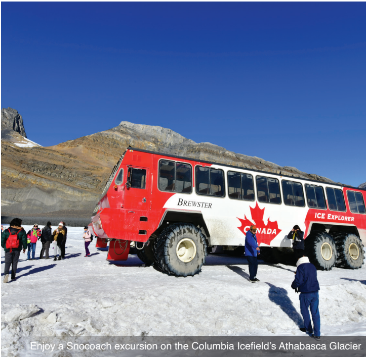
Enjoy a Snocoach excursion on the Columbia Icefield's Athabasca Glacier